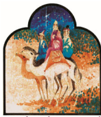
Magi from the east arrived

The English translation of the Psalm Responses from the Lectionary for Mass © 1969, 1981, 1997, International Commission on English in the Liturgy Corporation. All rights reserved.