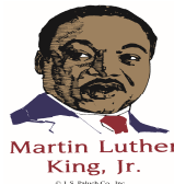
Martin Luther King, Jr.